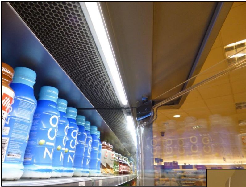
Original Cabinet Includes traditional tube lighting & nightblind.