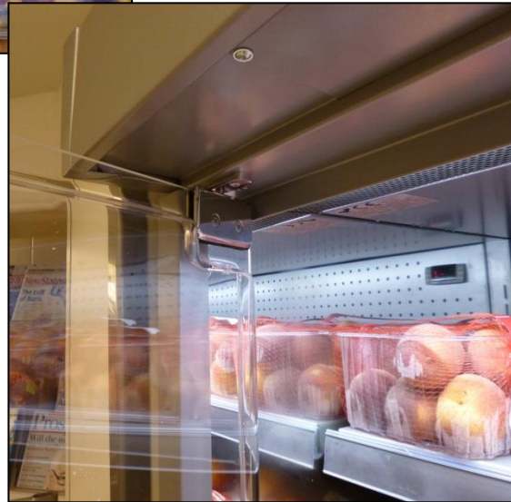
Modified Cabinet Light tube & nightblind removed.

Modifications include removal of standard canopy lamps & introduction of integrated LED lighting strips. A hydrocarbon safety system has also been fitted.